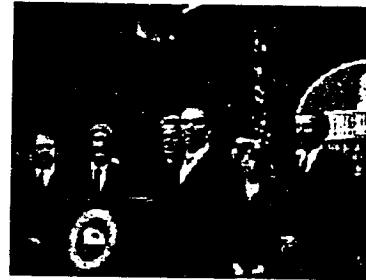
Governor Schwarzenegger calls for more discussion on pension reform.