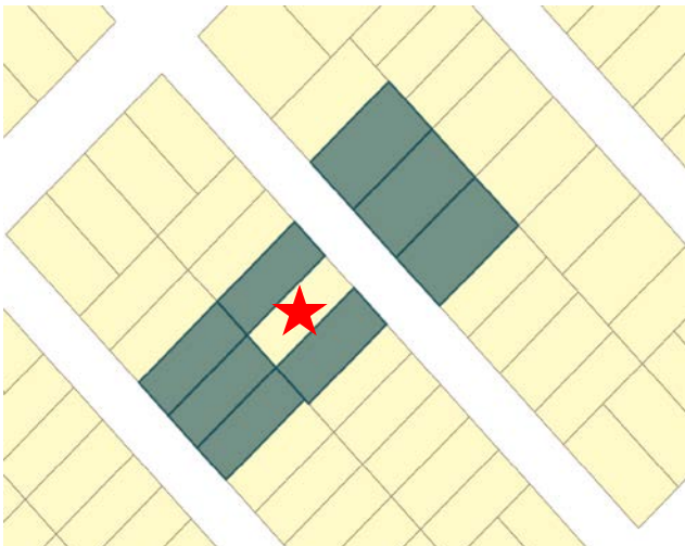
Example A – Interior Lot

Adjacent property owners and tenants must be notified of the project prior to application submittal. Examples of “adjacent” are shown on the sample maps below –any property that shares a property line, a corner, or is across the street from the subject property should be notified. For properties with more than 5 units on a single site, notice to the property manager and property owner may be sent in lieu of individual notification to each tenant.