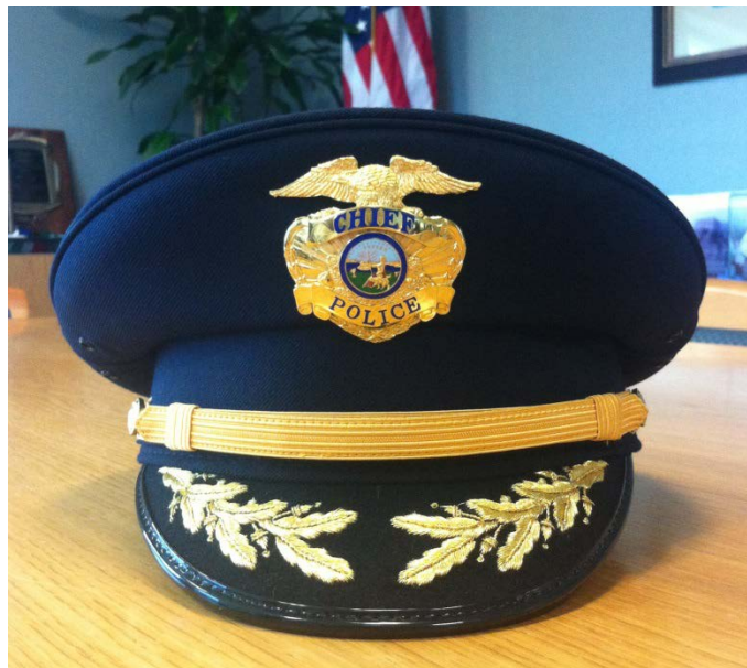
Chief Officer Dress Cap

Chief Officer caps will have two gold leaf branches on the visor. The branches will have three leaf clusters each with the stems pointing outward.