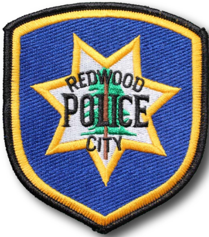
Regular and Navy Utility Uniform Patch