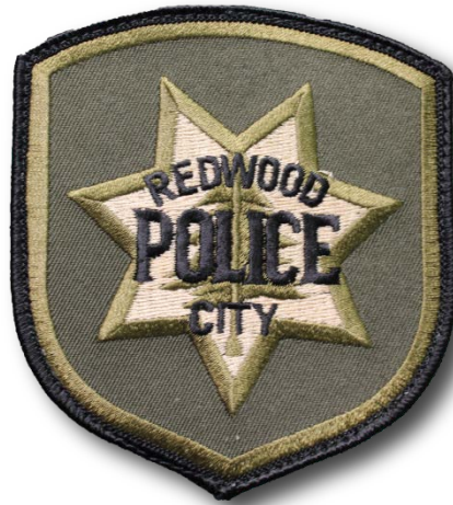
SWAT Uniform Patch