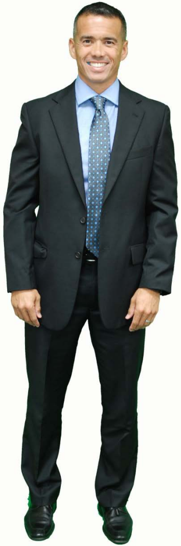
Business jacket or coat

Personnel assigned to the Investigations and Administrative Divisions shall wear business attire with an option to dress down at the division commander's discretion.