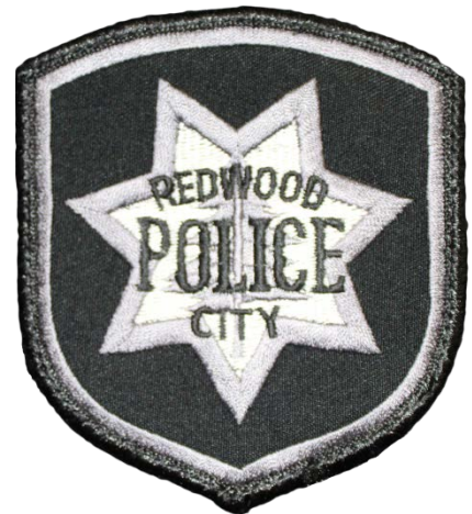
Black Utility Uniform