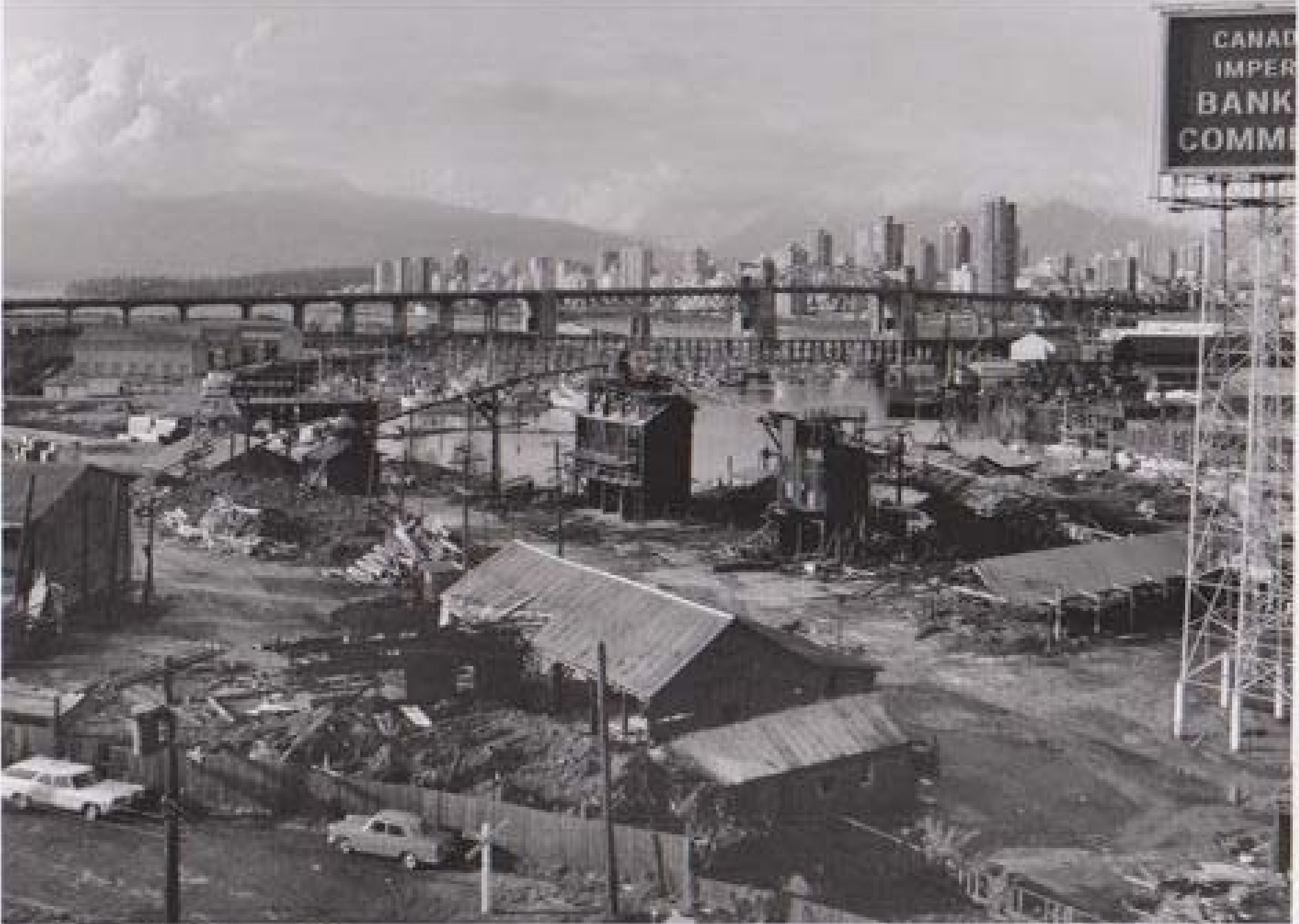
Granville Island 1971