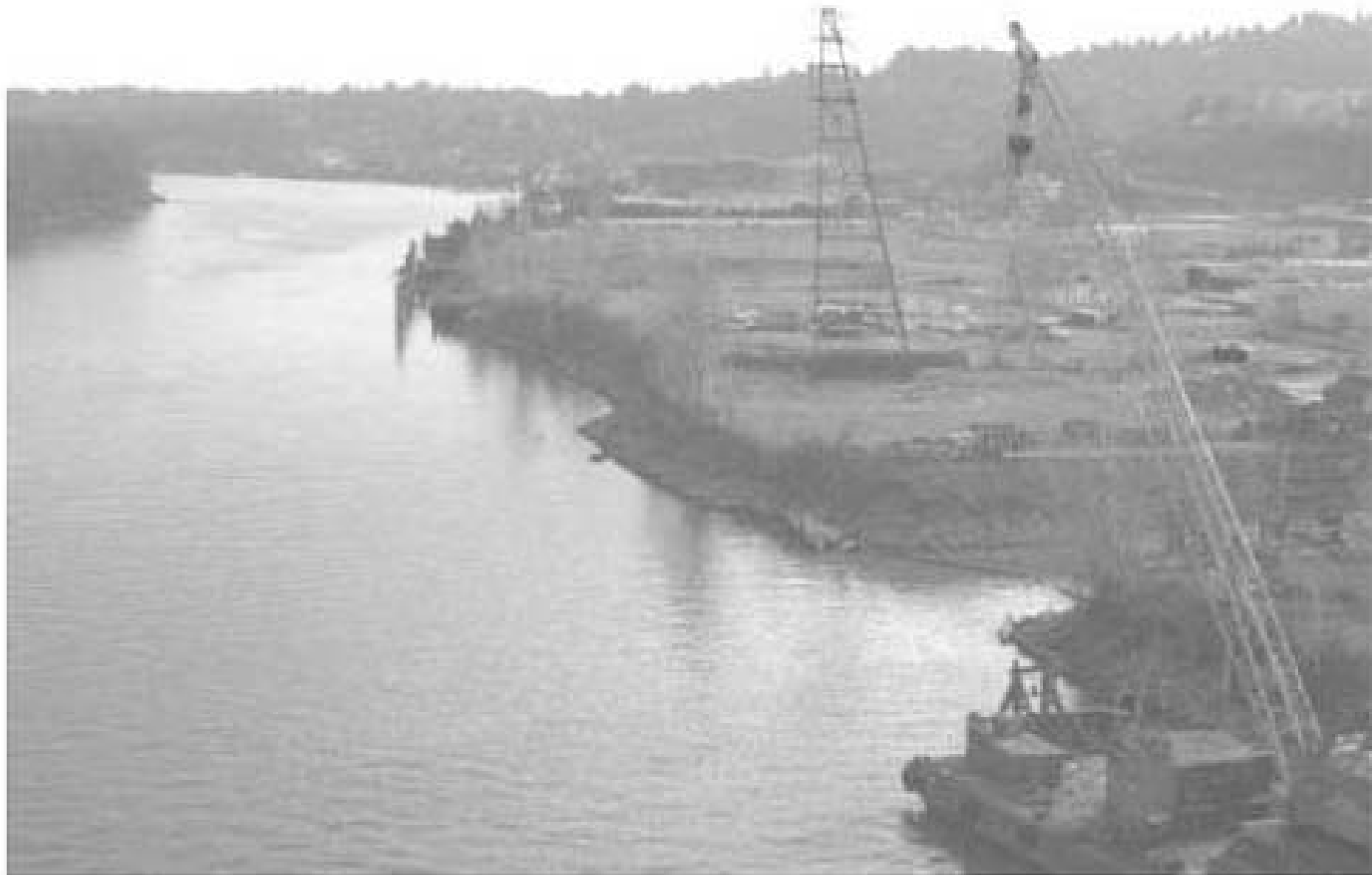
View of South Waterfront District, looking south from the Ross Island Bridge