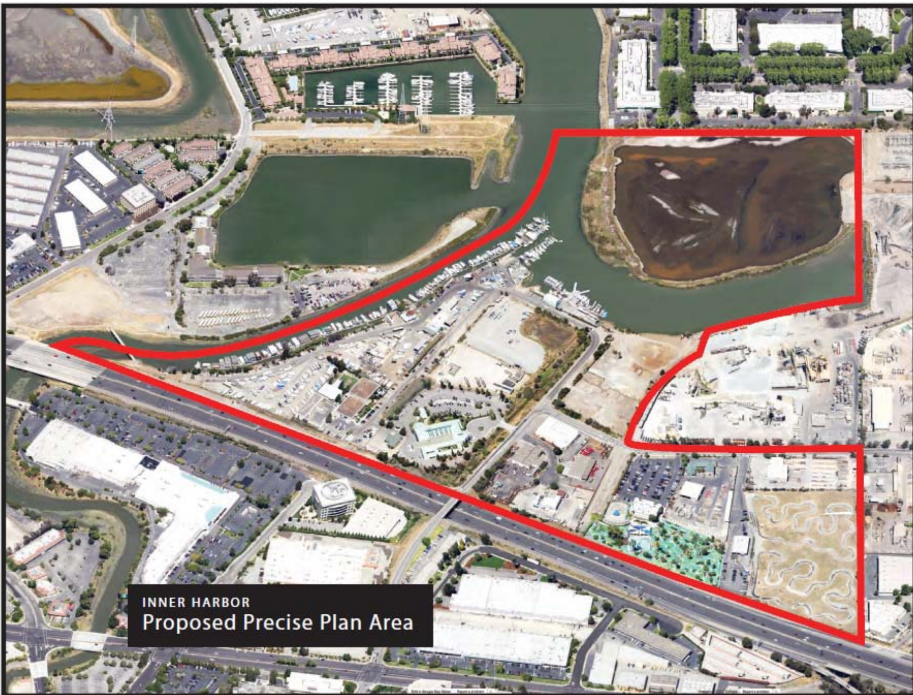
INNER HARBOR Proposed Precise Plan Area