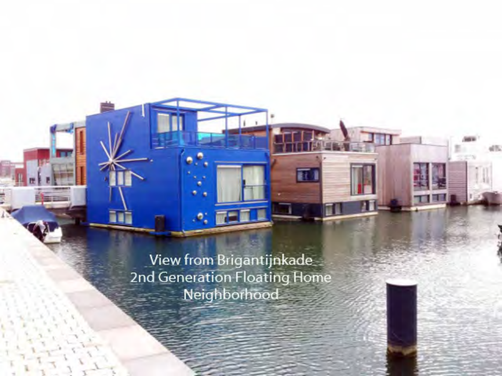
View from Brigantijnkade 2nd Generation Floating Home Neighborhood