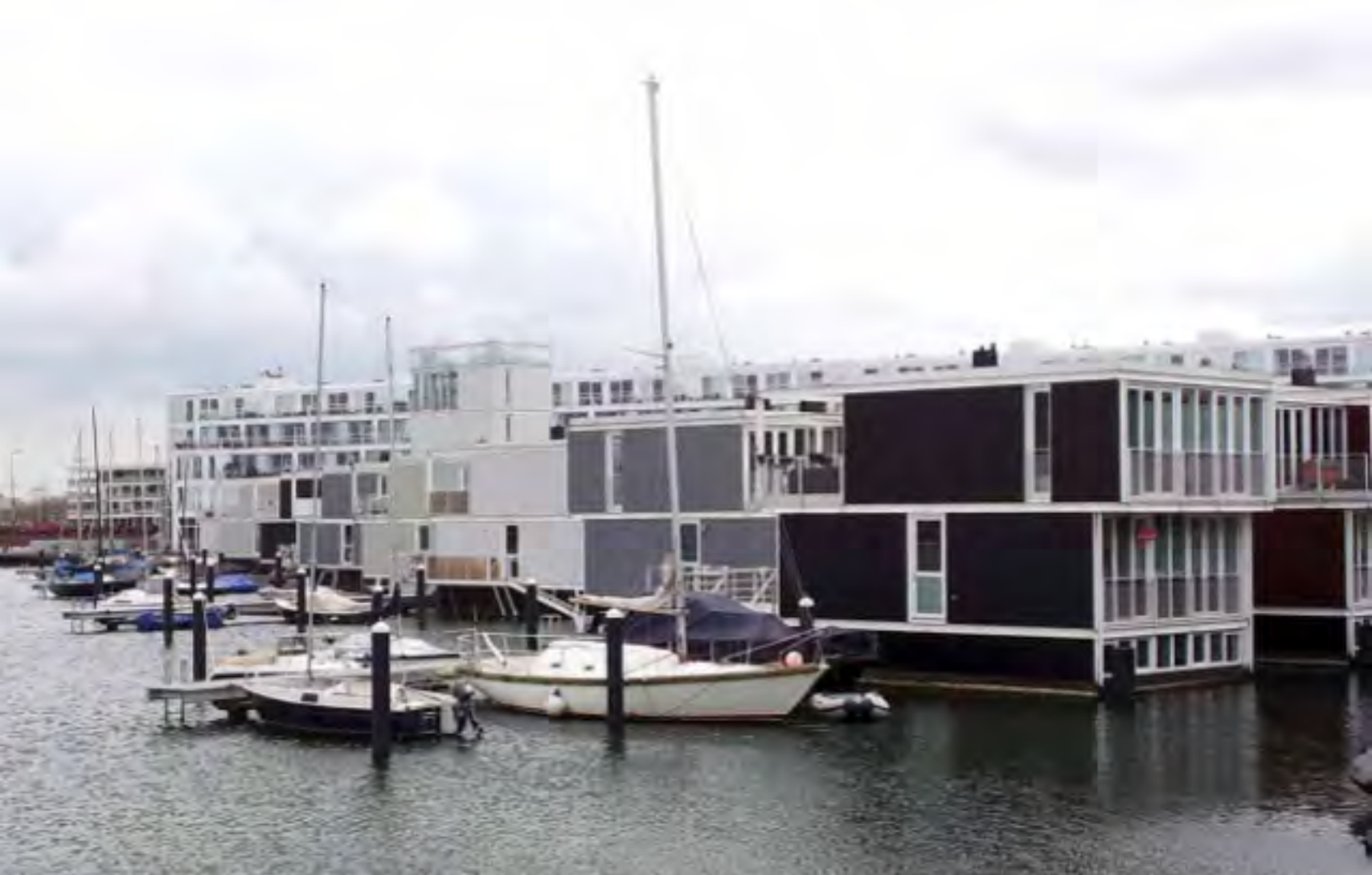
Walkway along Haringbuisdijk View of 1st Generation Floating Homes