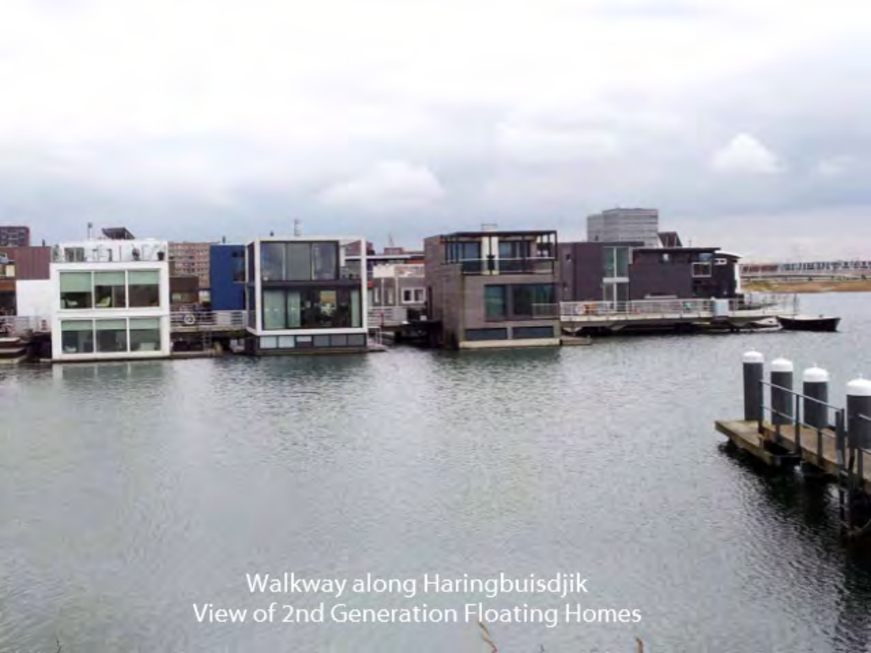
Walkway along Haringbuisdijk View of 2nd Generation Floating Homes