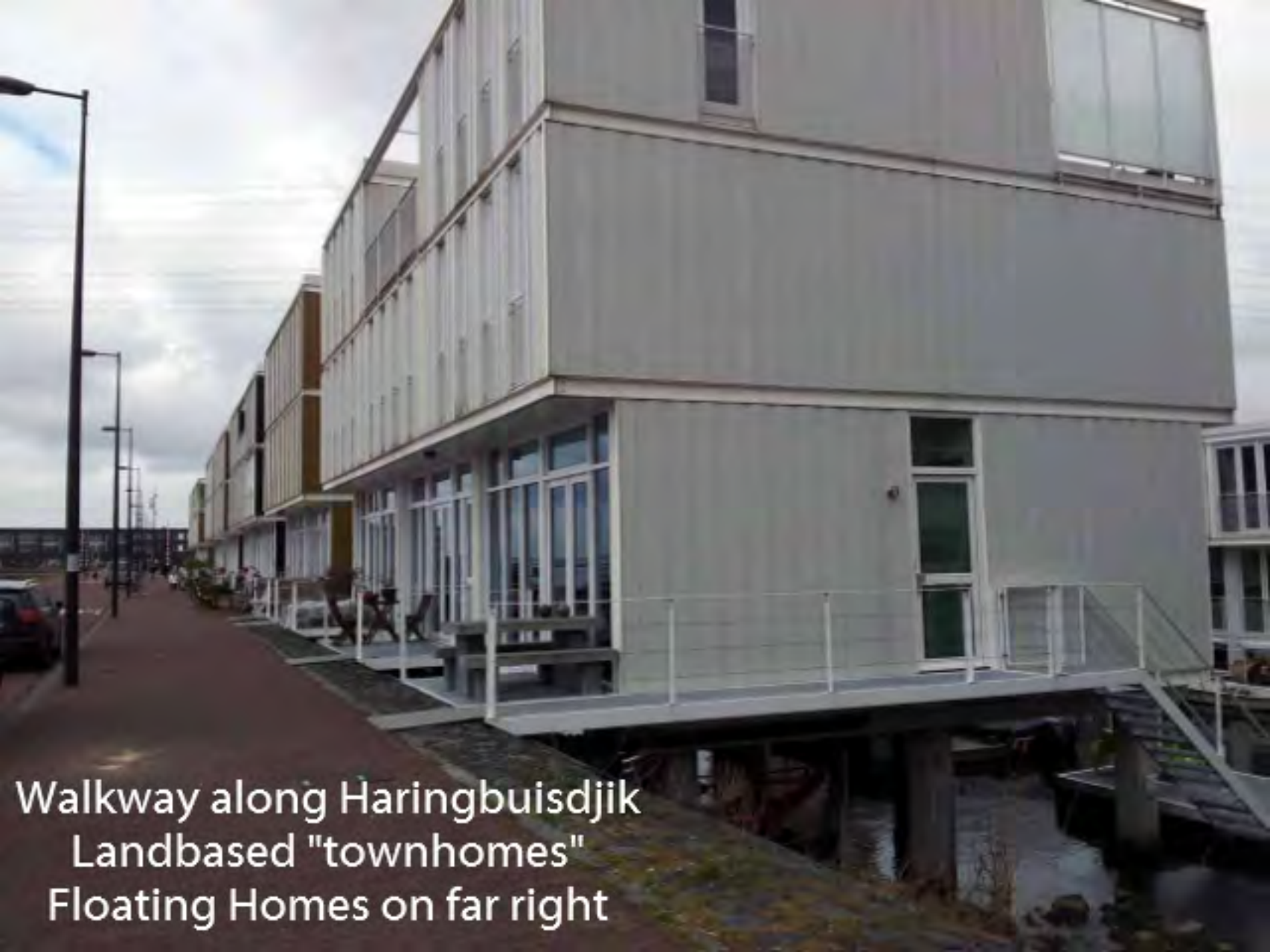
Walkway along Haringbuisdijk Landbased "townhomes" Floating Homes on far right