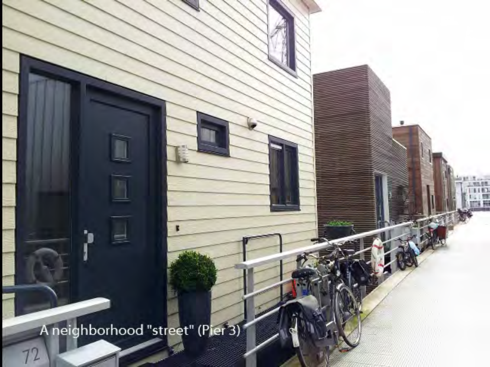
A neighborhood "street" (Pier 3)