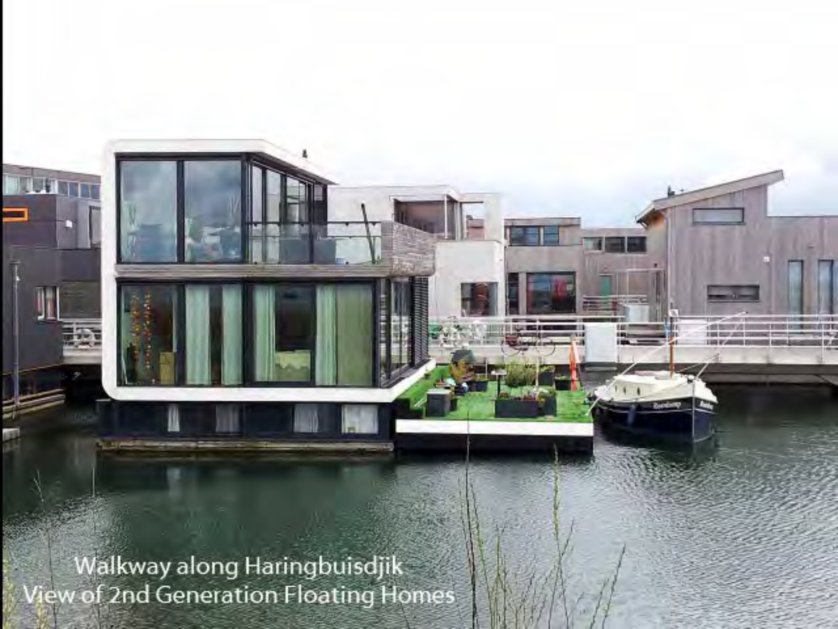
Walkway along Haringbuisdijk View of 2nd Generation Floating Homes