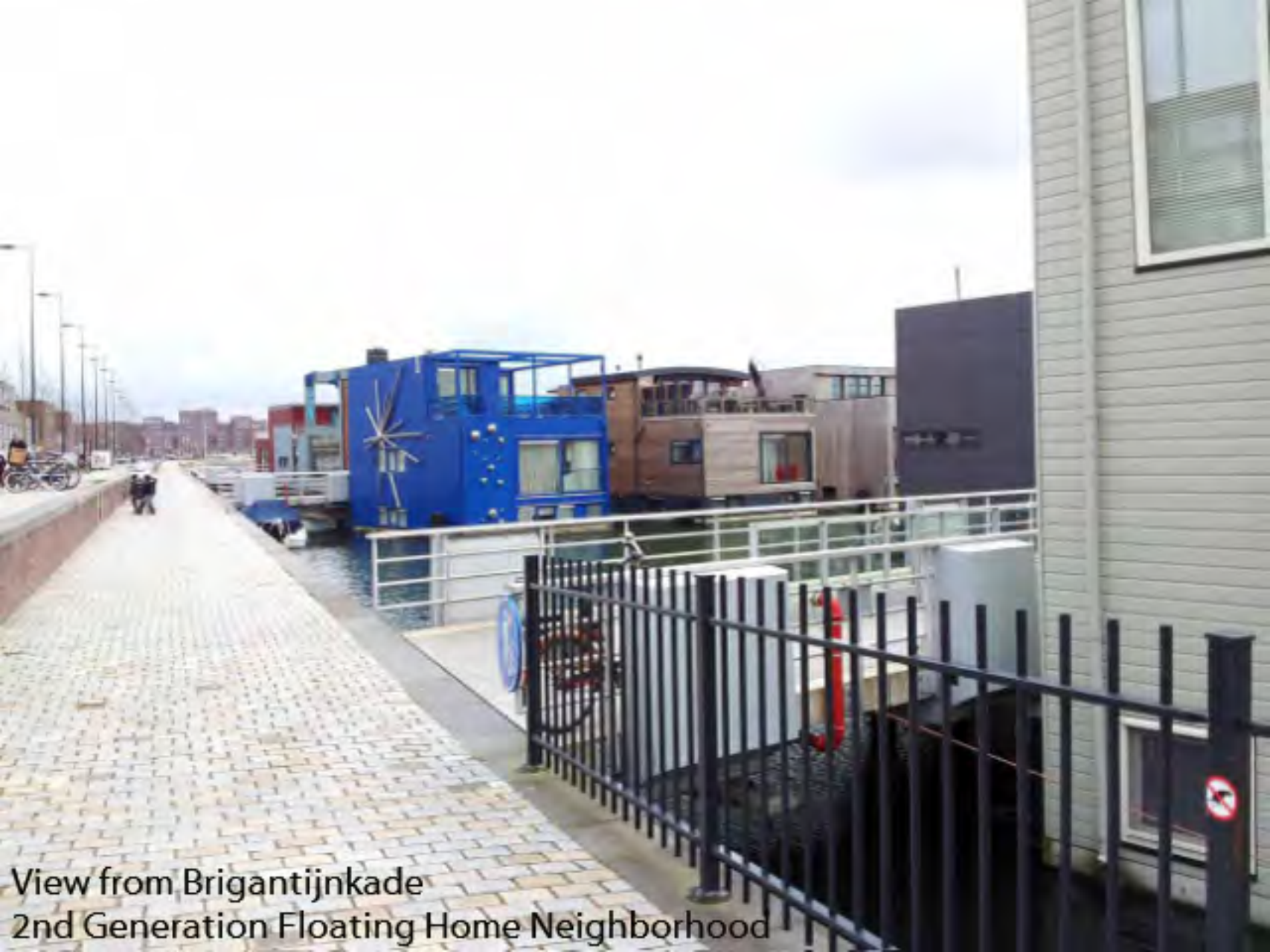
View from Brigantijnkade 2nd Generation Floating Home Neighborhood