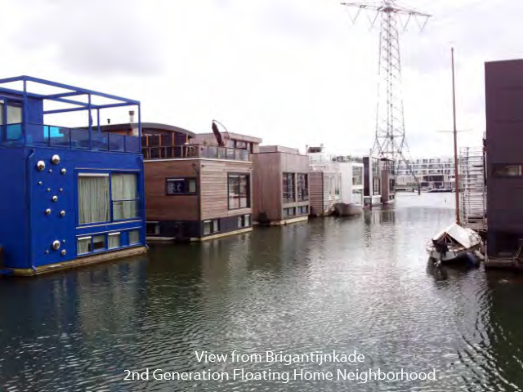
View from Brigantijnkade 2nd Generation Floating Home Neighborhood