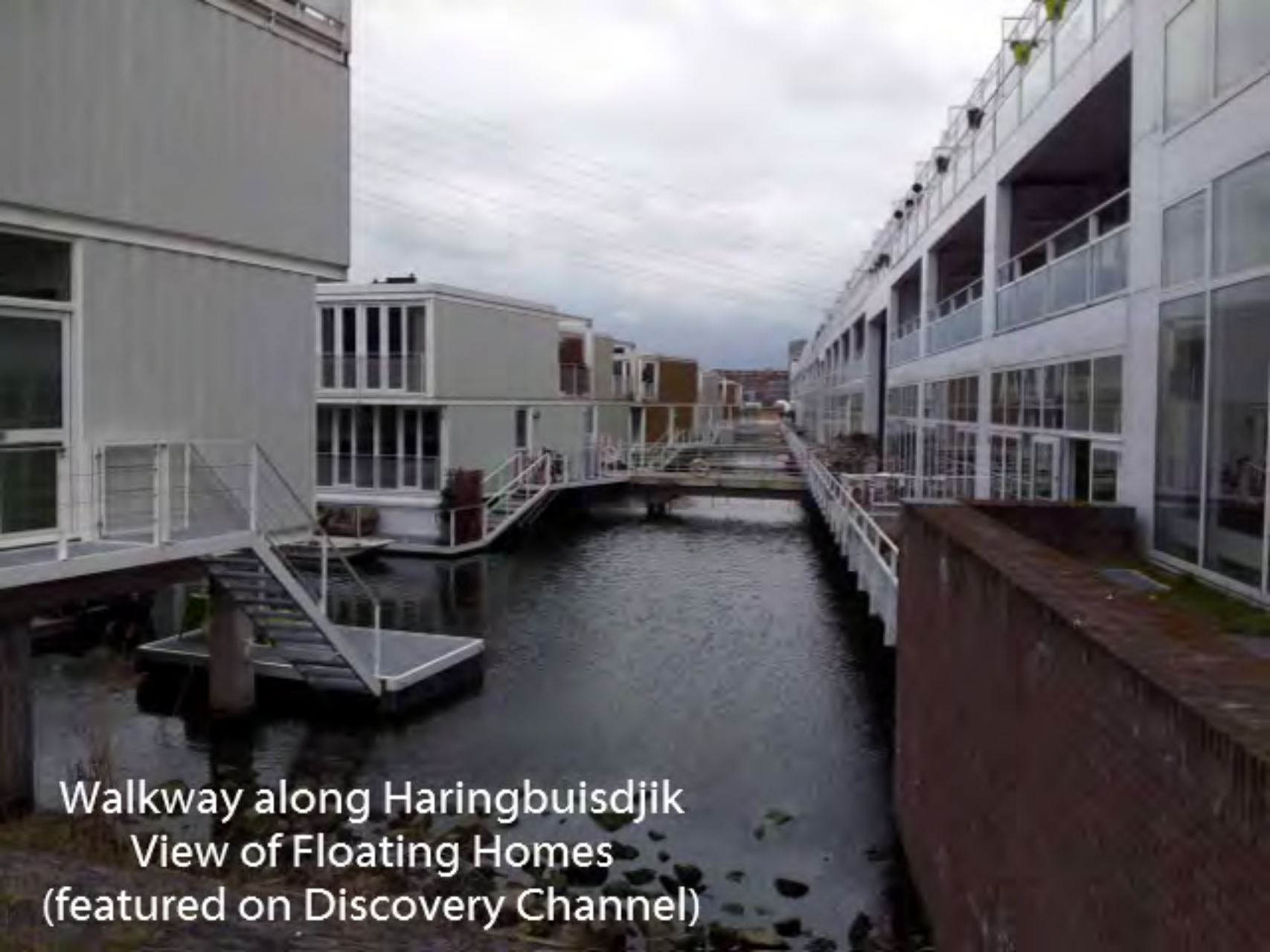
Walkway along Haringbuisdijk View of Floating Homes (featured on Discovery Channel)