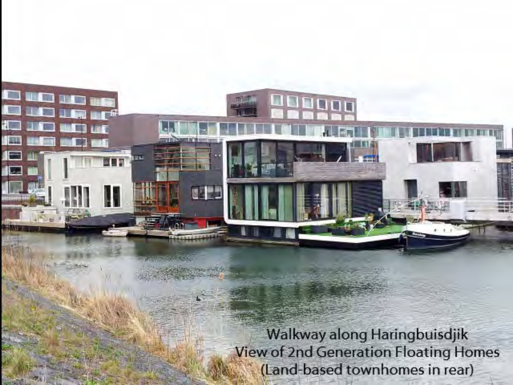
Walkway along Haringbuisdijk View of 2nd Generation Floating Homes (Land-based townhomes in rear)