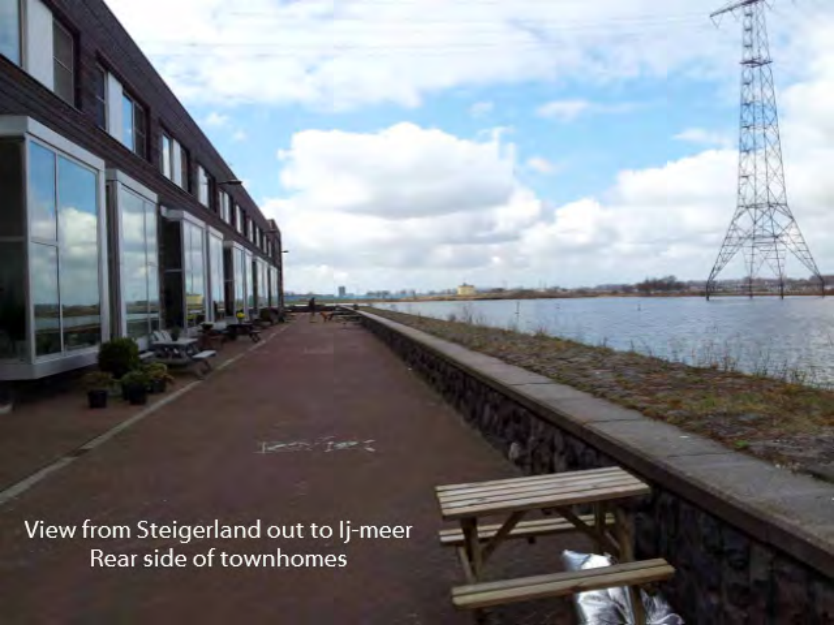
View from Steigerland out to IJ-meer Rear side of townhomes