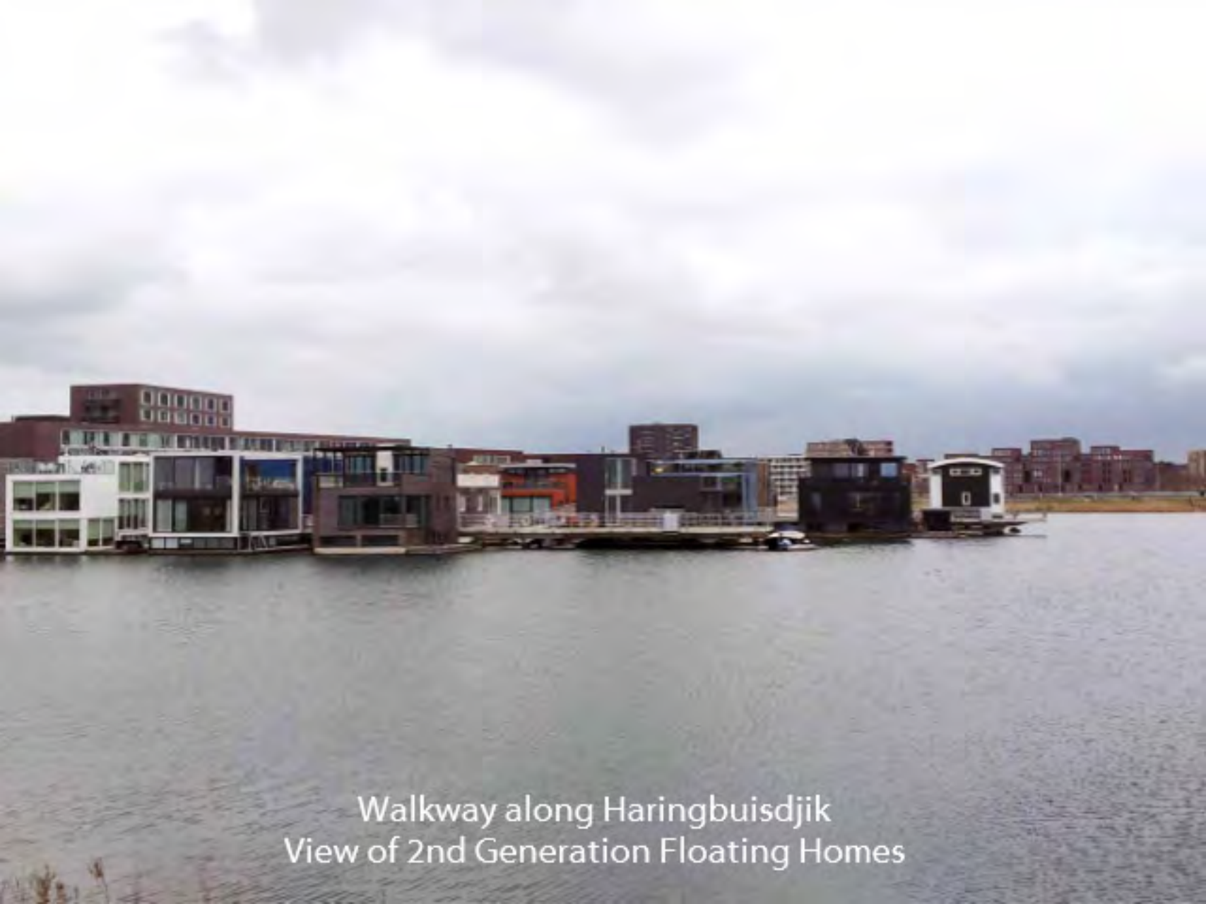
Walkway along Haringbuisdijk View of 2nd Generation Floating Homes