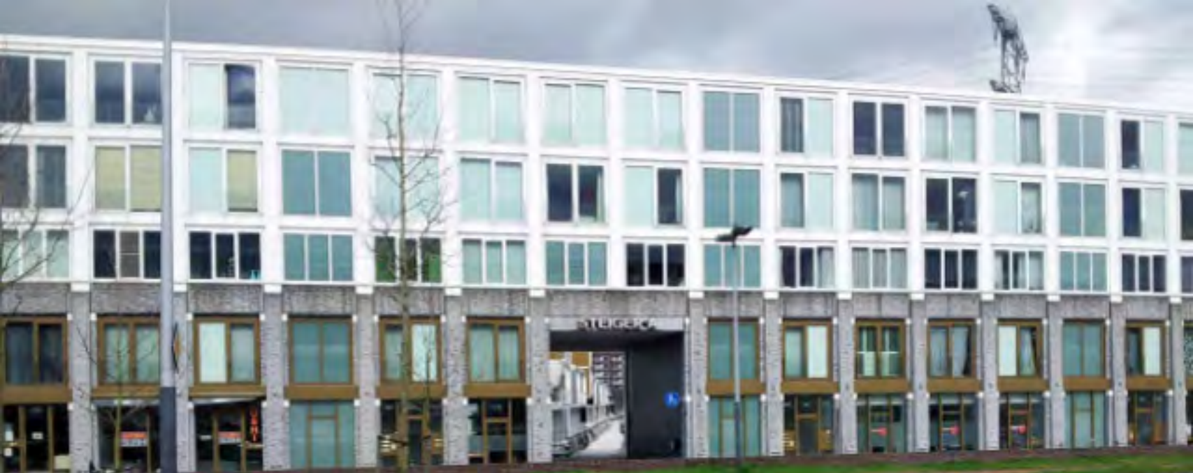
Tram 26 along Ijburglaan at Steigerland (on the way to Ijburg)