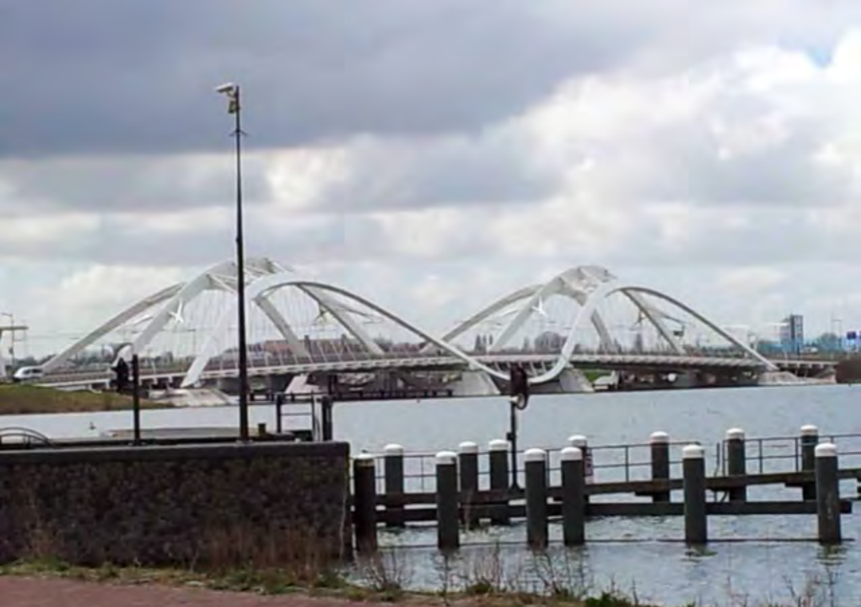
Modern bridge to Zeeburg and Amsterdam