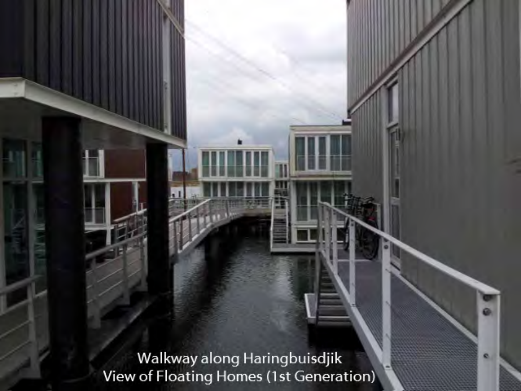
Walkway along Haringbuisdijk View of Floating Homes (1st Generation)