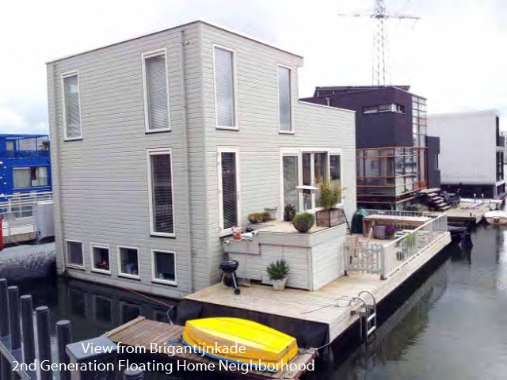
View from Brigantijnkade 2nd Generation Floating Home Neighborhood