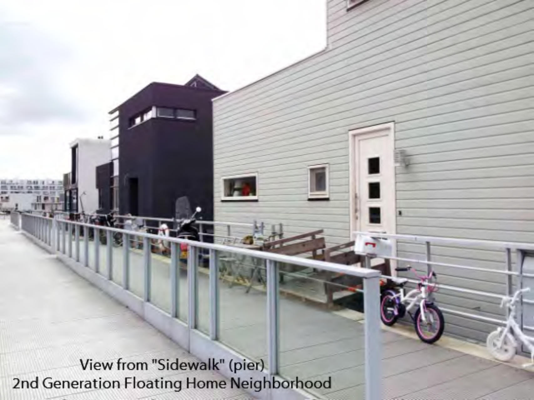
View from "Sidewalk" (pier) 2nd Generation Floating Home Neighborhood