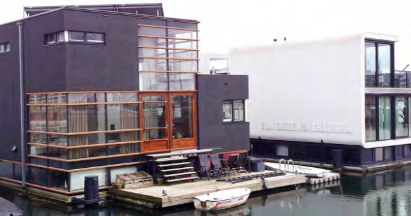
Walkway along Haringbuisdijk View of 2nd Generation Floating Homes