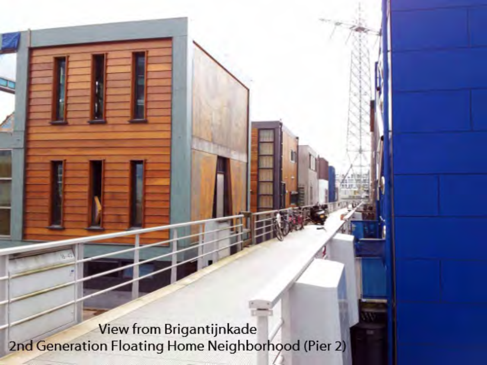
View from Brigantijnkade 2nd Generation Floating Home Neighborhood (Pier 2)