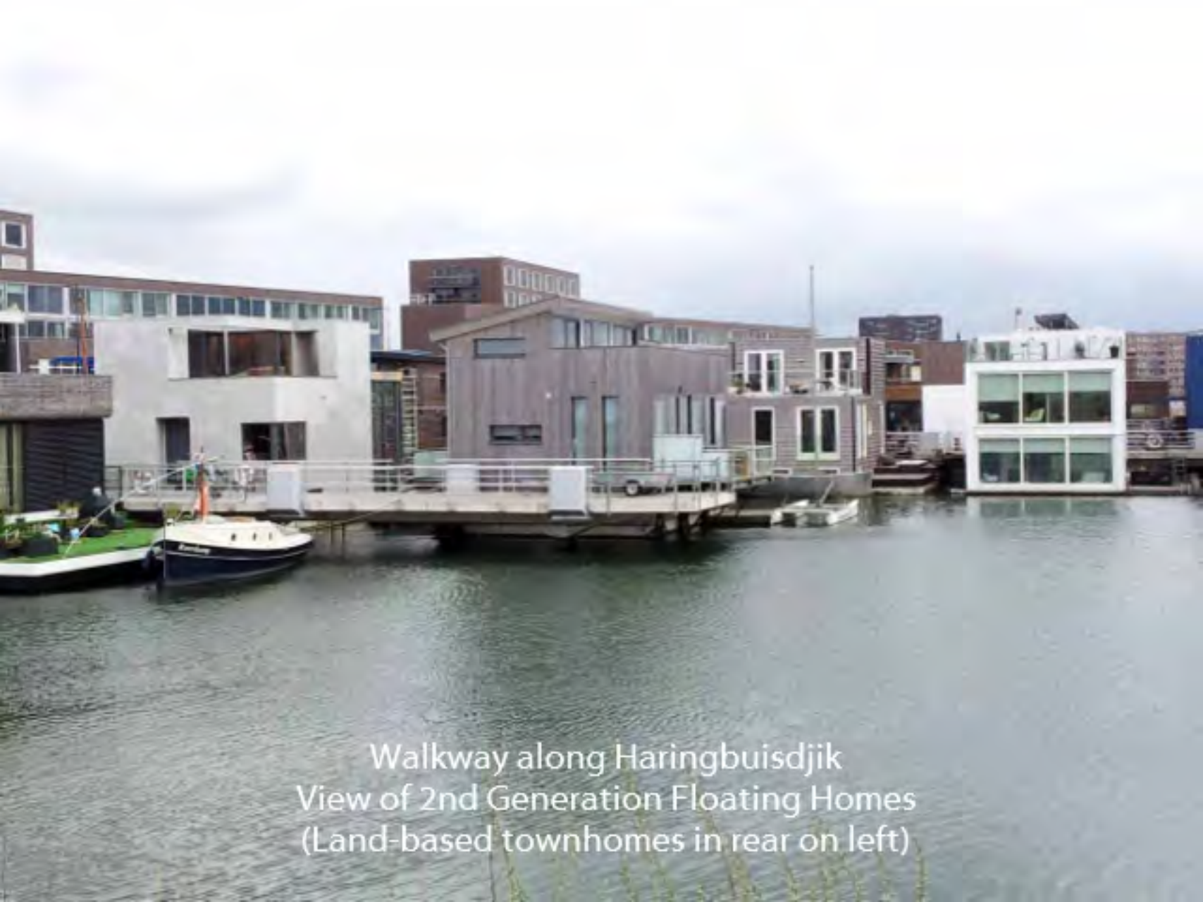
Walkway along Haringbuisdijk View of 2nd Generation Floating Homes (Land-based townhomes in rear on left)